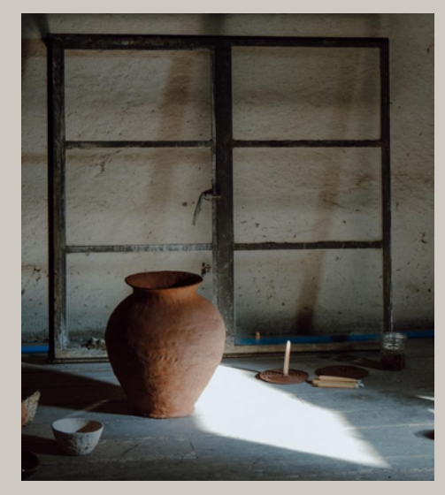
TASH FRY KLA // The Loft

*We regret that The Loft can only be accessed by a staircase.