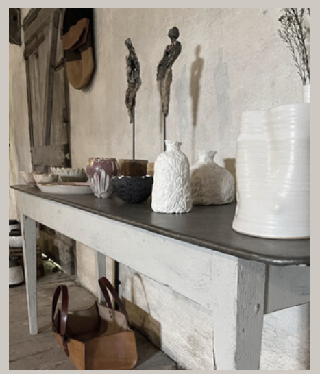
VIGOUR & SKILLS // The Loft