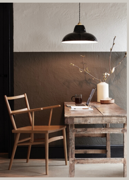
ANGLEPOISE // The Cafe