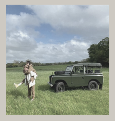
TOOGOOD // The Parkland